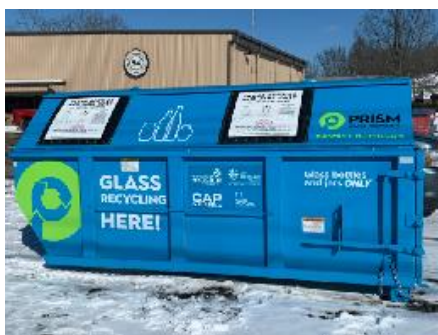
AF Dobler Hose & Ladder Co. Highest fill volume at 4,000 lbs.

Fill Rates: Despite the cold temps and snow flurries, residents filled five boxes in 35 days diverting 18,160 pounds (9.1 tons) of recyclable glass containers from the landfill (Table 1) [avg wt.: 3,632 lbs., avg. days in service: 26]. The other 10 boxes are filling steadily with four of them on their way to be ready for exchange within the coming weeks (Figure 2). Underutilized locations will be reassessed for possible relocation at the end of March.